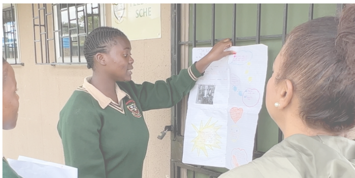
Careerbuilder explaining her plan to her coach

In a country where youth unemployment is high, CareerBuild is making a real difference. By providing young people with the skills and training they need to succeed, the program is helping to break the cycle of poverty and create a brighter future for all South Africans. The success of CareerBuild shows us that we can all play a role in building a better future for our communities, and that every little bit counts.