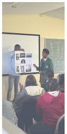
Careerbuiders and coaches preparing vision boards to present in front of audience