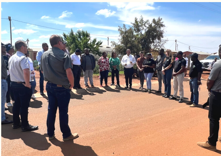
Site visit at BBL households in Khutsong

As a responsible corporate citizen, DRDGOLD's commitment to sustainable development extends beyond its core business operations. Through their FWGR SLP, they have successfully implemented a Livelihoods programme, empowering thousands of willing participants in the communities around their operations.